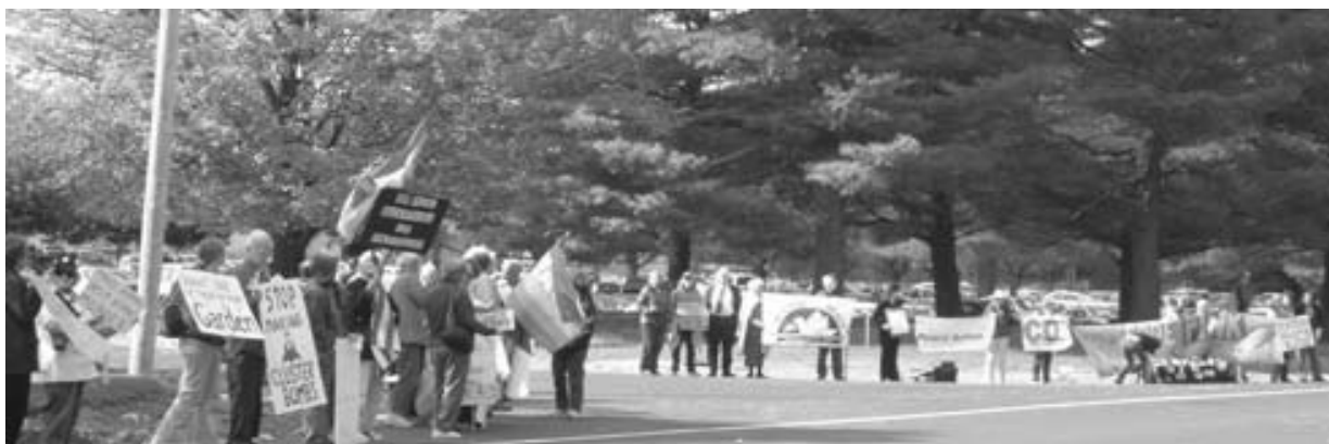
MVPP on an October weekday at Textron see p.3