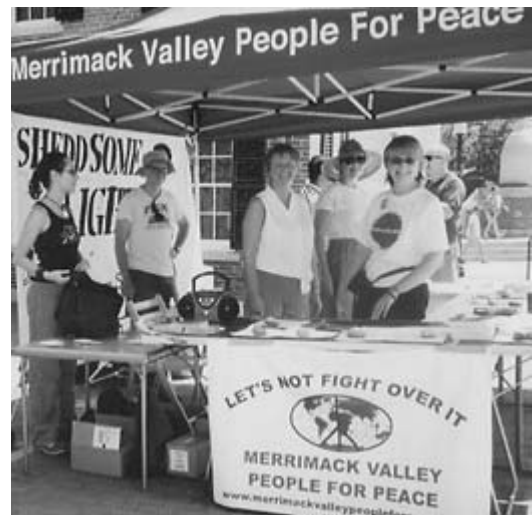
MVPP at the Lowell Folk Festival July, 2006